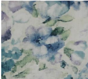
Sky (Accent Chair Only)